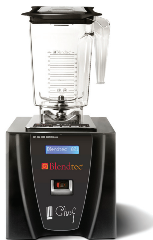
No Sound Enclosure